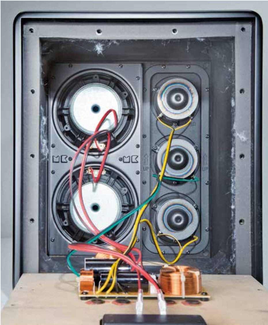
The crossover network is attractive, well built and with fine components.